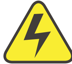
Risk of Electric Shock Risk of severe electric shock