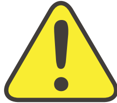
Warning, Danger or Caution Risk of Personal Injury

The symbols below are used throughout this manual to identify important safety information. Heed all warnings and safety information.