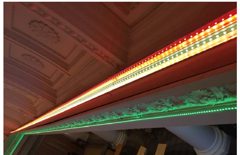
Top down shot of the installation: Red = Clear Lens, Yellow = 30° Lens, Green = 60° Lens

During our discussion, we asked the question: could LED tape do the job? Could the product, with its 120° angle of light spread, wash evenly enough to illuminate the entire ceiling from both sides? Maintaining the evenness of the light along the length of the room was not a problem. The issue was getting enough even intensity up to the top of the ceiling. The solution was Rosco's new, aluminum RoscoLED Tape Profiles that feature different lenses to alter the beam angle of the emitter's output.