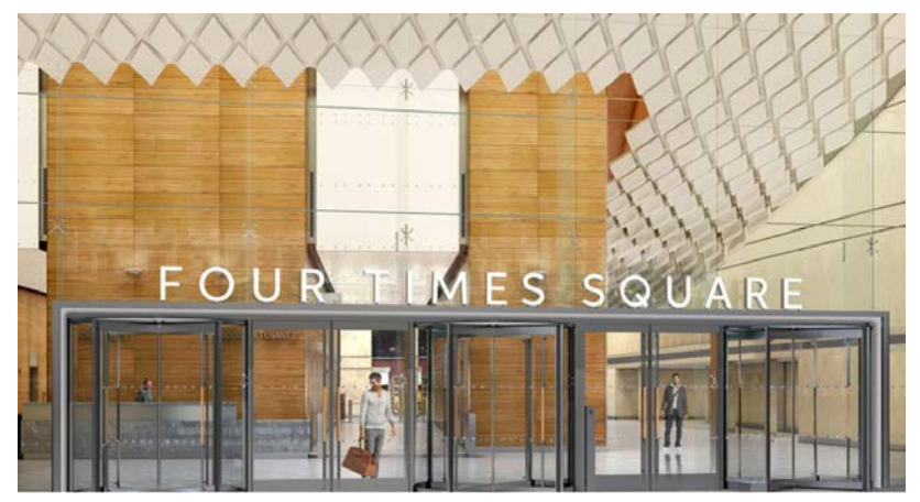
Rendering of the new lobby inside Four Times Square

Four Times Square, located in Midtown Manhattan, is widely regarded as the nation's first green skyscraper. Formerly known as the Condé Nast Building, it was among the first in New York City to incorporate green design and construction by including energy-efficient lighting & temperature-control systems, stringent clean-construction standards, and a high percentage of recycled building materials.