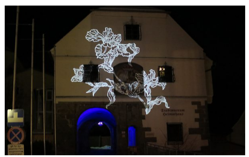
The Rosco Image Spot projects a floral custom gobo onto the Stadtmuseum

A number of different lighting shows were installed along the festival's circular pathway. Kasper focused on illuminating the town's vintage façades with floral and natural projections using Rosco's Image Spot projectors and Rosco custom gobos. "Image Spot is a small projector that creates perfectly clear and bright images on any surface," he said, and he also let us know that the Image Spot is "a very good tool work with."