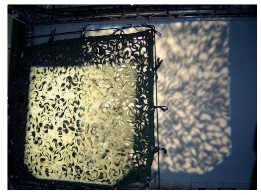
Butterfly manufactured with Camoflage Net